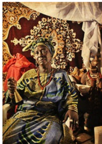
Level 2 Gallery: Contested Terrains